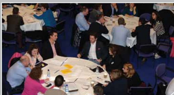
Last year's National Conference: Delegates enjoyed time to network with colleagues from other schools between sessions.